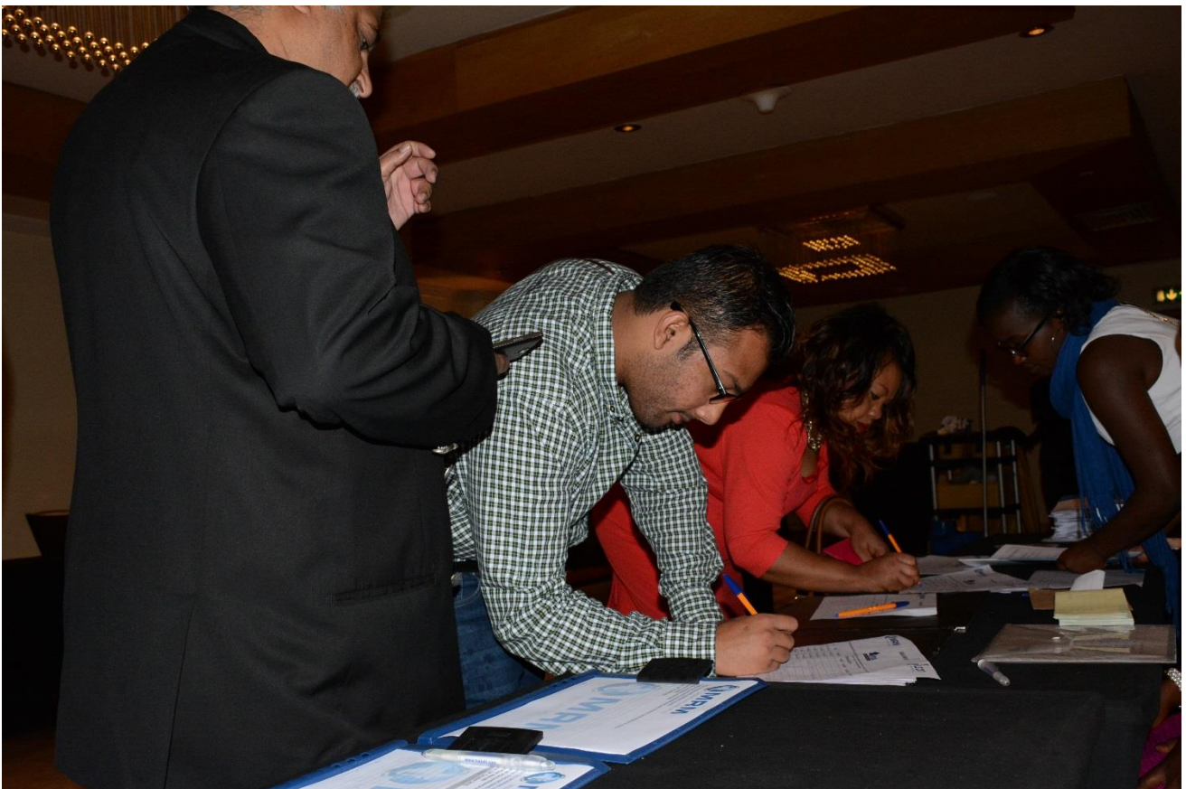
Guests registering to attend the event

Subsequently, the event showed evidence of the grave need for the public sector to work closely with the private sector and other relevant agencies and authorities to ease business processes in the real estate industry.