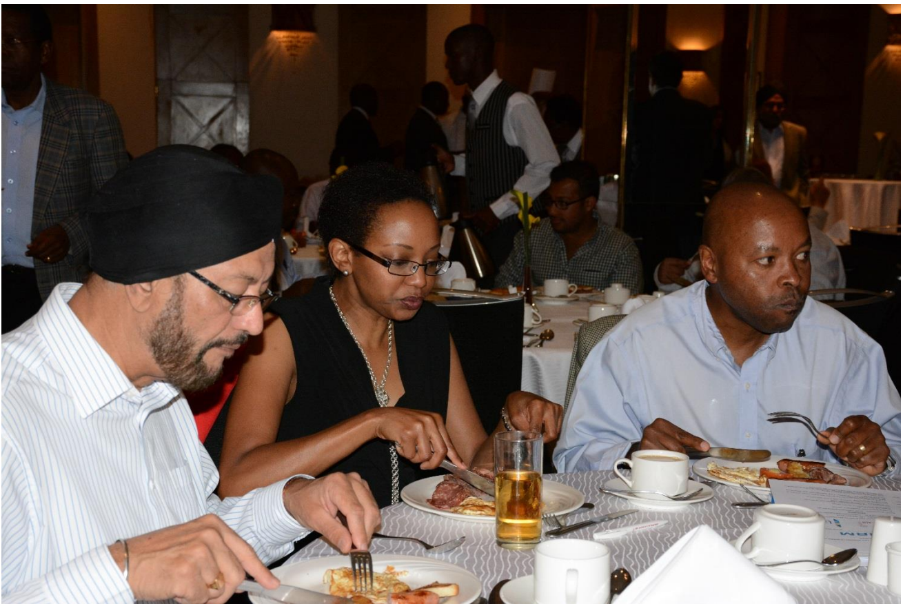
Guests listening to proceedings during the forum