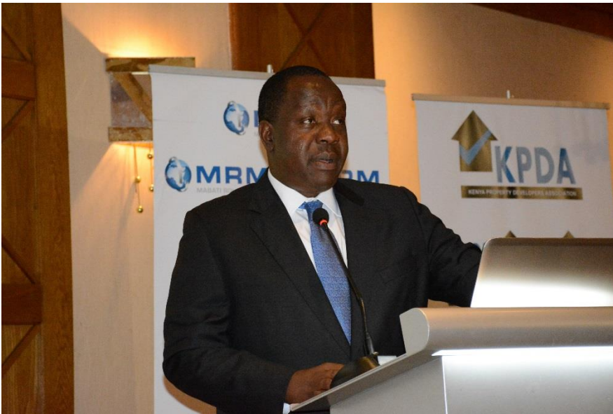
Actg. CS, Ministry of Land, Housing and Urban Development, Dr. Fred Matiang'i

'No one has a monopoly of knowledge with regards to the Kenyan land sector and, I honestly believe we need to move forward. Kenya's land sector has the worst form of corruption and racketeering in the management of public resources.